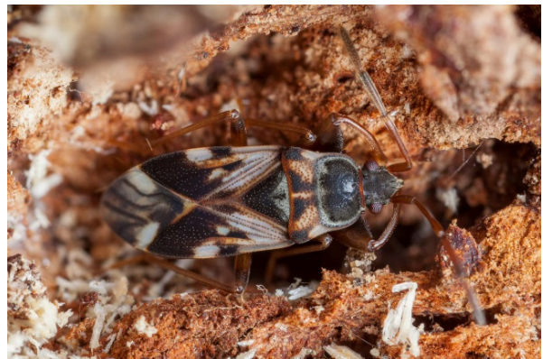
Fig. 6. Scolopostethus pictus