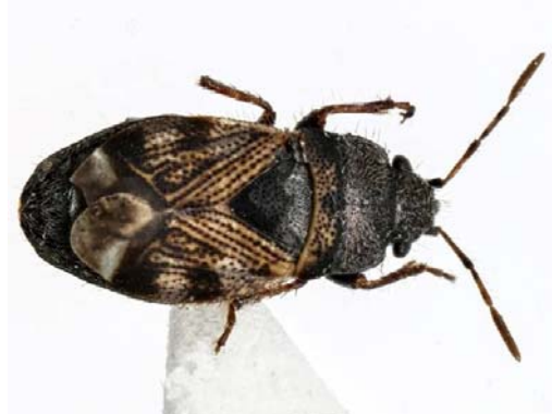
Fig. 4. Pionosomus varius