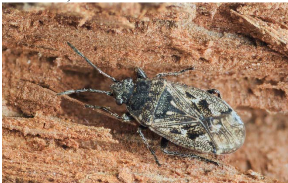
Fig. 7. Sphragisticus nebulosus