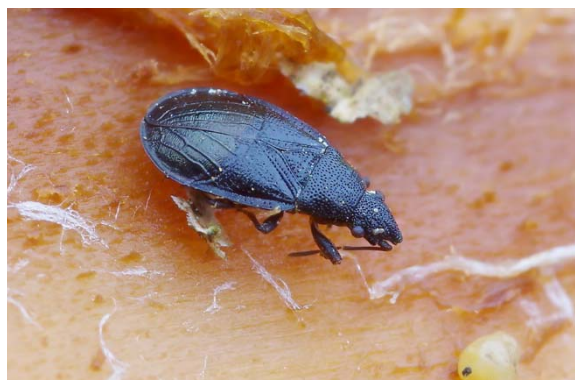
Fig. 3. Philomyrmex insignis