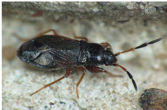
Fig. 2. Megalonotus antennatus