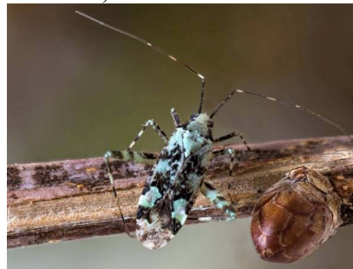
Fig. 10. Phytocoris tiliae