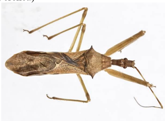
Fig. 11. Nagusta goedelii