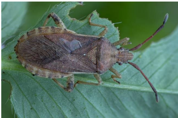
Fig. 1 Ceraleptus lividus

This species widespread in South and Central Europe, except Great Britain, Netherlands and Denmark. It is absent in northern Europe – Scandinavian countries as well as Baltic countries Estonia and Latvia (Péricart, 2001). This thermophilic species occurs in meadows. Host plants - various species of sage ( Salvia sp.).