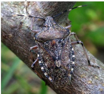
Fig. 9. Rhaphigaster nebulosa