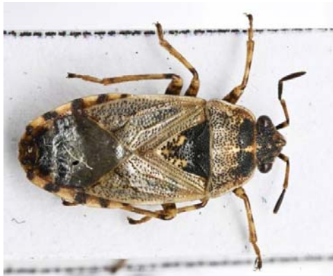
Fig. 5. Platylax salviae