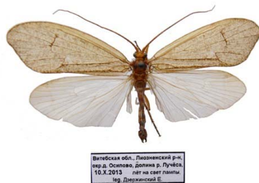
Figure 1. Lype phaeopa ♂, wingspan - 10,5 mm Figure 2. Anabolia concentrica ♂, wingspan - 40 mm