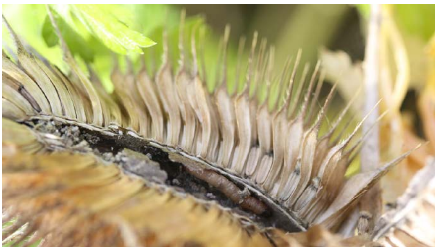
Fig. 3. Endotaenia gentianana in a seed head of Dipsacus