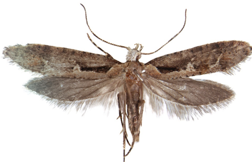
Fig. 2. Rhigognostis schmaltzella