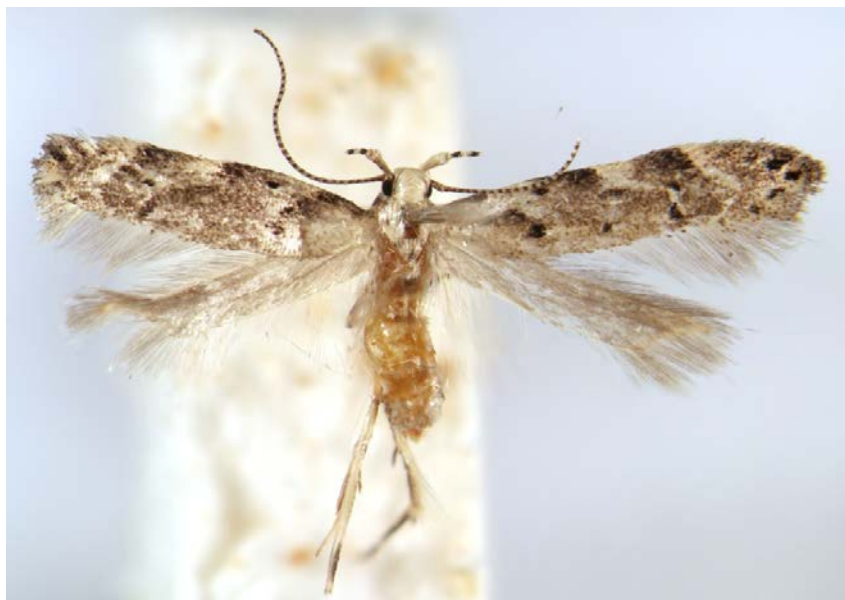
Fig. 4. Coleotechnites piceaella