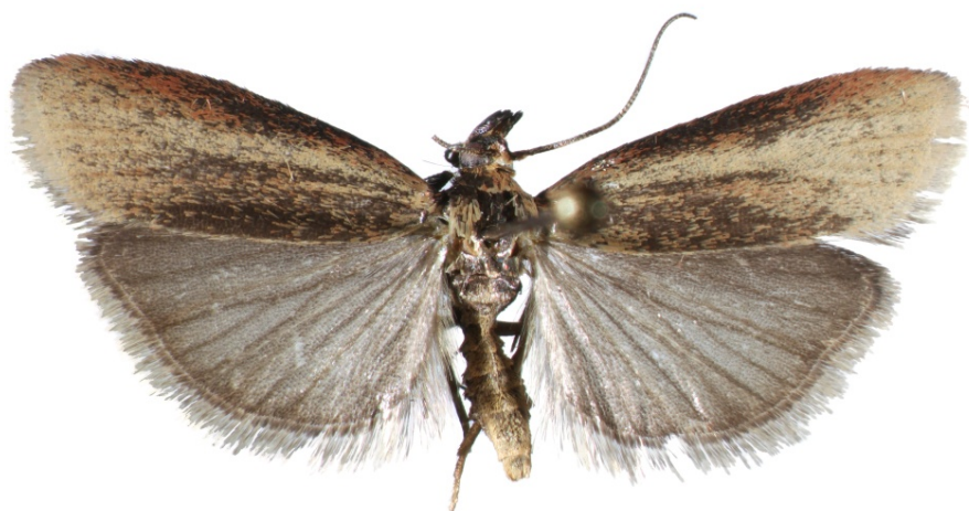
Fig. 5. Sciota lucipetella