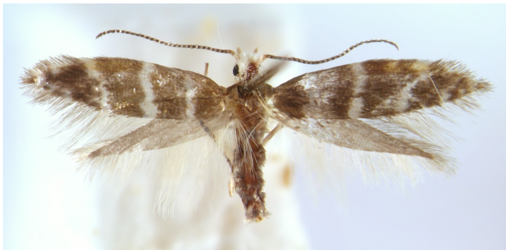
Fig. 1. Argyresthia trifasciata