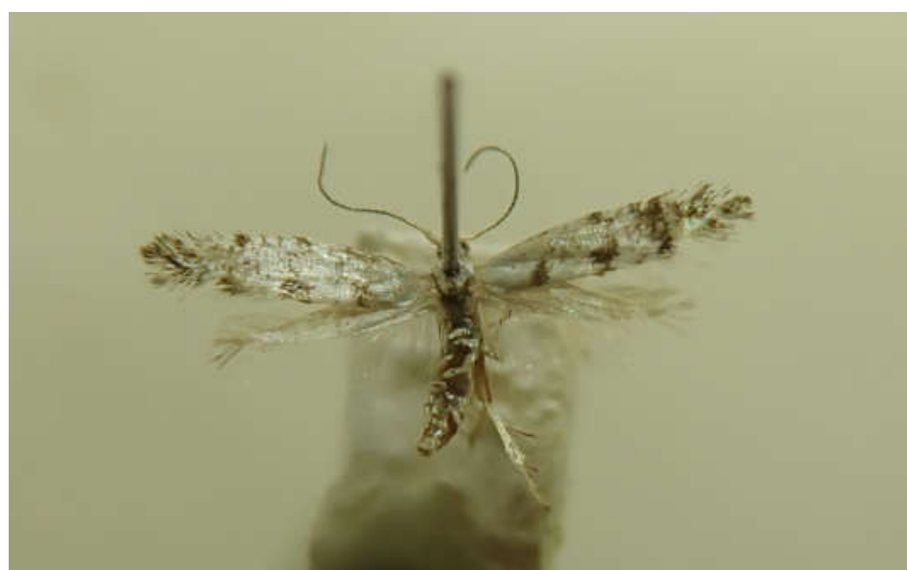
Fig. 2. Argyresthia thuiella