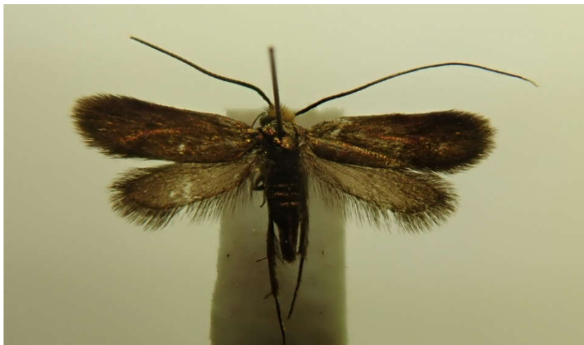
Fig. 1. Adela violella