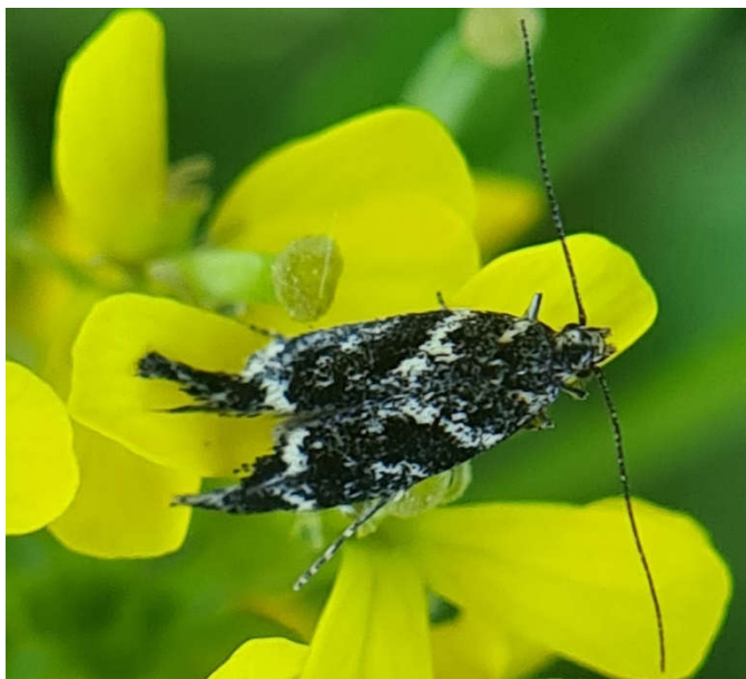
Fig. 4. Klimeschiopsis kiningerella